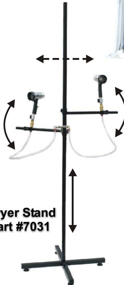
Adjustable Dryer Stand with Guns Part #7031