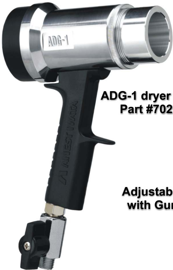
ADG-1 dryer only Part #7023